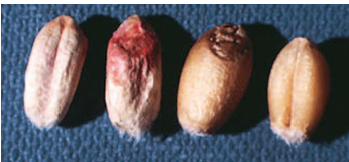
Figure 4. Bleached and shriveled tombstone kernels (left) compared to healthy wheat kernels.

Seed infected with Fusarium graminearum can produce seedlings affected by seedling blight when planted. Infected seeds will have poor germination and the resulting seedlings may be slow to emerge. Infected seedlings will be reddish-brown to brown, will lack vigor, and will tiller poorly.