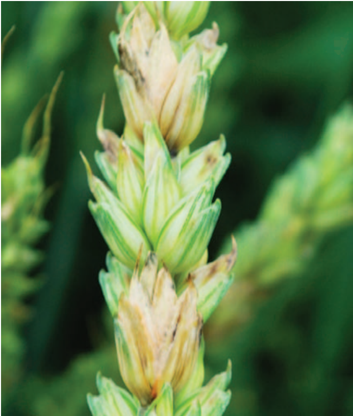
Figure 3. Pink to orange masses of fungal spores may be present on infected spikelets.