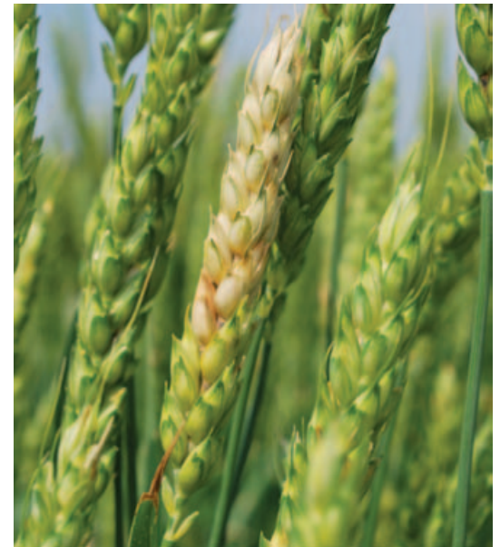
Figure 1. An individual spikelet infected with Fusarium graminearum . During favorable conditions, the fungus may spread into the rachis and infect spikelets above or below the infection point.

If examined closely, pink to orange masses of spores may be visible on infected spikelets. These spore masses are produced during wet, humid weather (Figure 3). Infected kernels, commonly called tombstones, appear shriveled, discolored, and are lightweight (Figure 4).